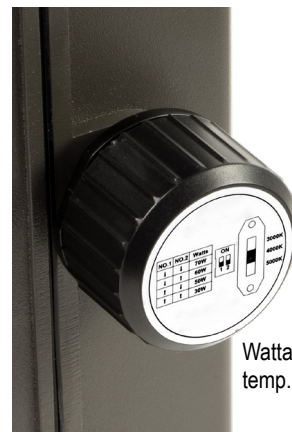
Wattage and color temp. controls.