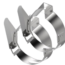
Mounting clamps included standard