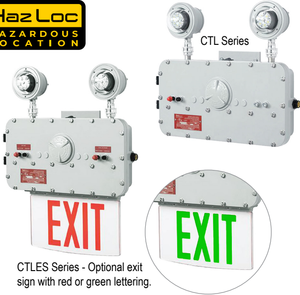
CTLES Series - Optional exit sign with red or green lettering.